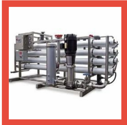
Zero Liquid Discharge System