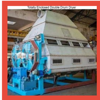
Totally Enclosed Double Drum Dryer