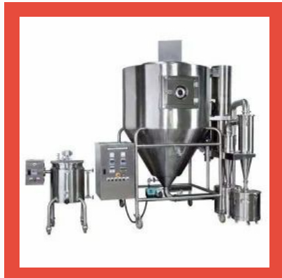
Continuous Particulate Dryer