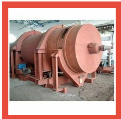
Rotary Cascade Dryers