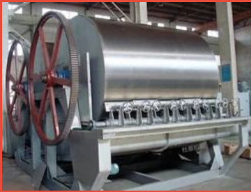
Single Drum Dryer