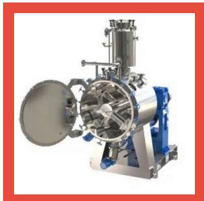
Vacuum Single Drum Dryer