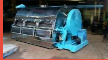
Single Drum Flaker