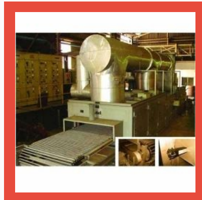
Air Impingement Dryer