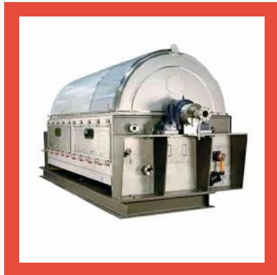
Atmospheric Double Drum Dryer