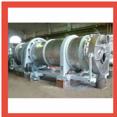
Rotary Louvre Dryer