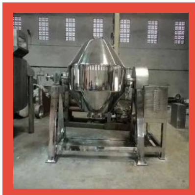
Double Cone Vacuum Dryer