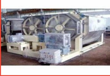
Double Drum Flaker