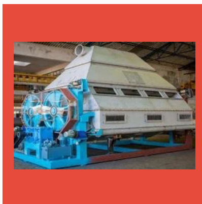
Totally Enclosed Single Drum Dryer