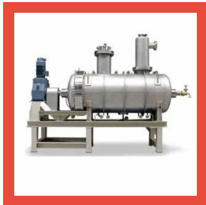
Rotary Vacuum Dryer