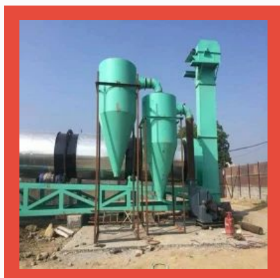
SS Drum Dryer